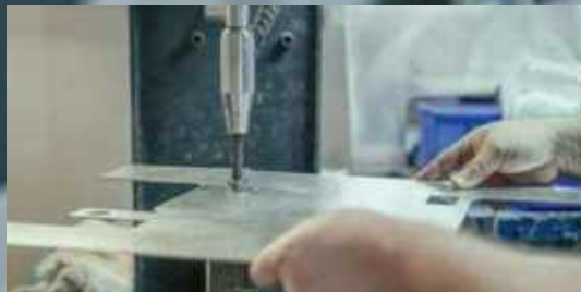
Hardware & Assembly