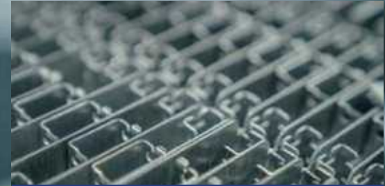
CNC Punching & Forming