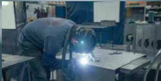
Welding & Fabrication